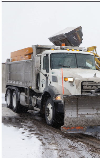
Dump Trucks Walking Floor