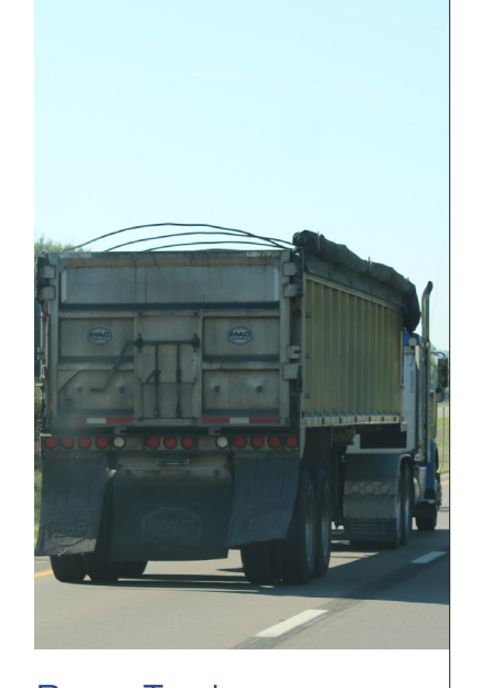
Dump Trucks Dump Trailers